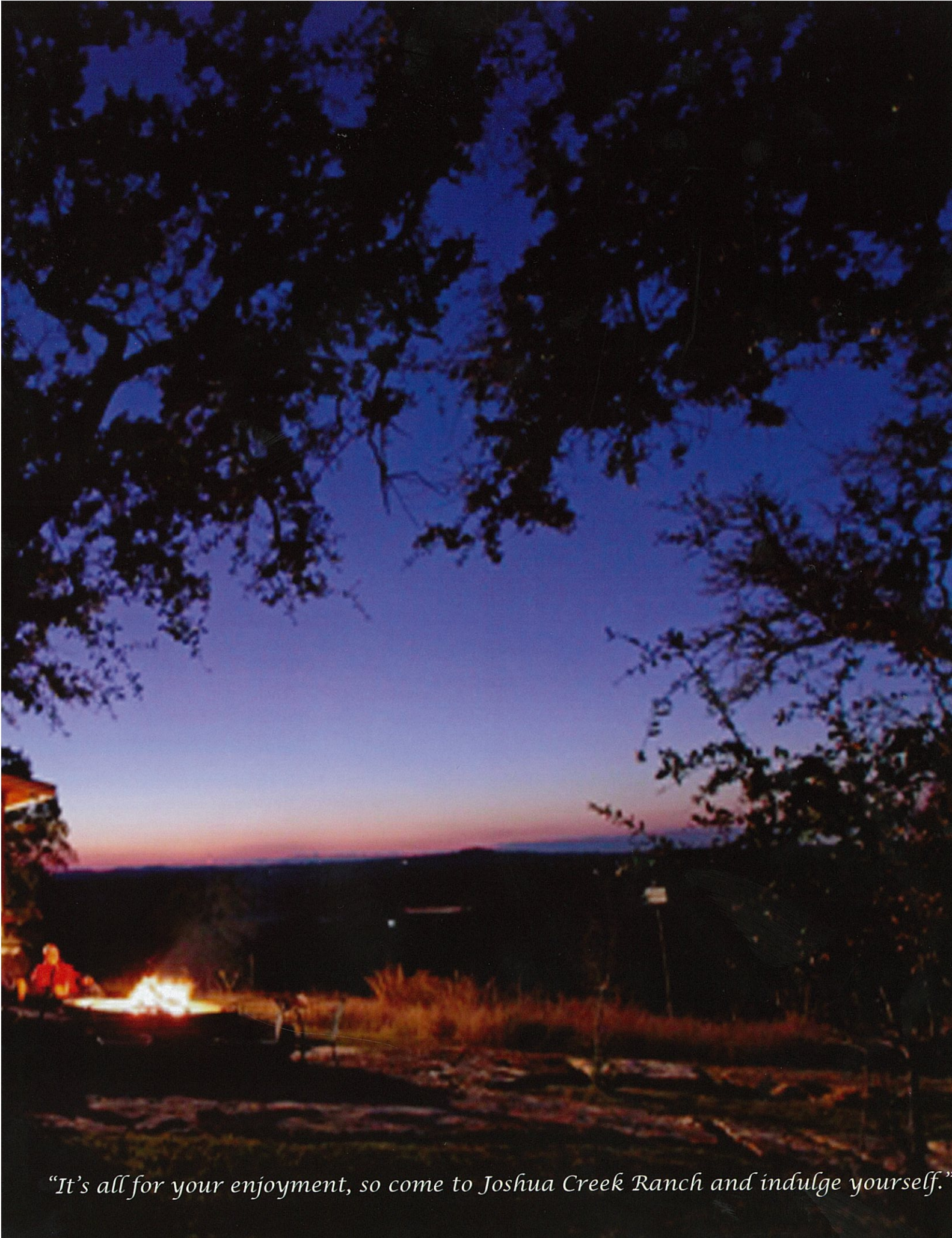
"It's all for your enjoyment, so come to Joshua Creek Ranch and indulge yourself."