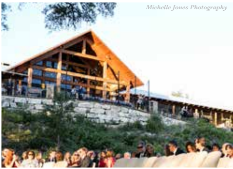
Michelle Jones Photography