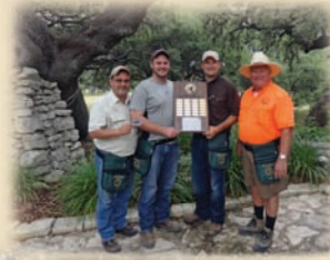
King Of The Hills Shoot Winning Team

Summer Sporting Clays shoots for charities, company events, bachelor parties, or just a group of friends.