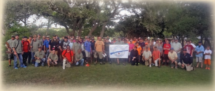
Knights of Columbus Dripping Springs, TX