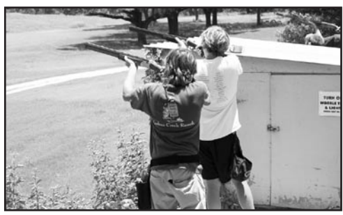
Competition Shooting at the Wobble Trap, JCR Youth Outdoor Adventure Program

MAIL TO: Joshua Creek Ranch P.O. Box 1946 * Boerne, TX 78006 (830) 537-5090 * (830) 230-5190