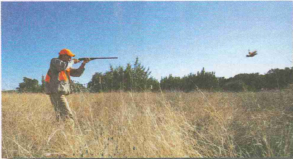
Dripping Springs Knights of Columbus sponsors the First Annual Hill Country Shootout August 25.

Proceeds from the charity event will support the Dripping Springs Knights of Columbus' community projects throughout the year.