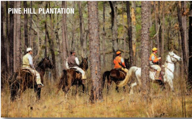
PINE HILL PLANTATION

commissioned back-lit stained glass windows, vintage photography and hand-crafted furniture. All meals are accompanied by fine wine pairings, and premium top-shelf liquors and the best cigars to be found anywhere.